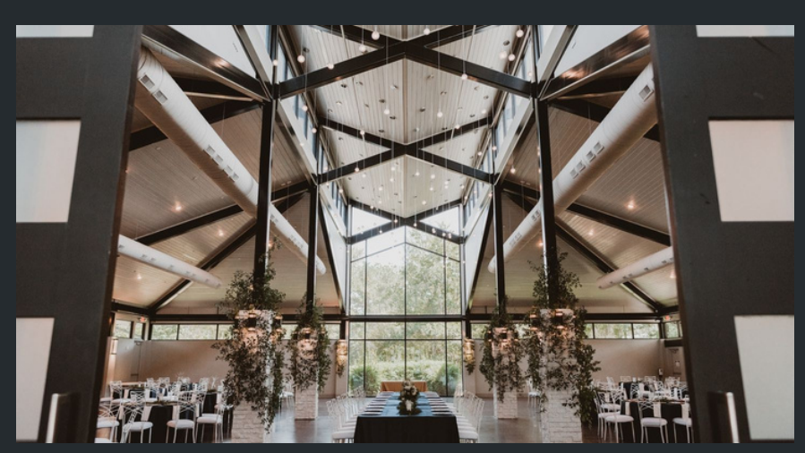
MOON VINE PAVILION